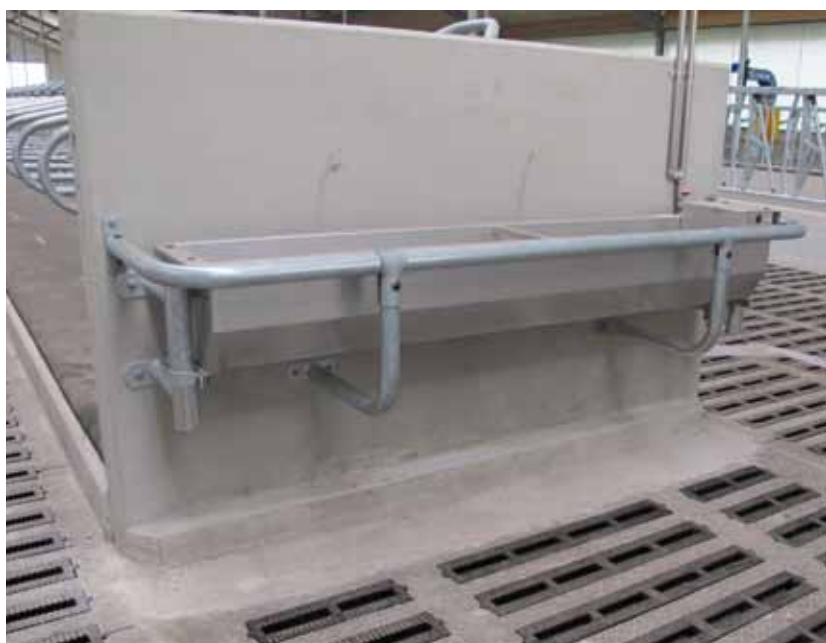
• Model 200, wall mounted whit protection brace