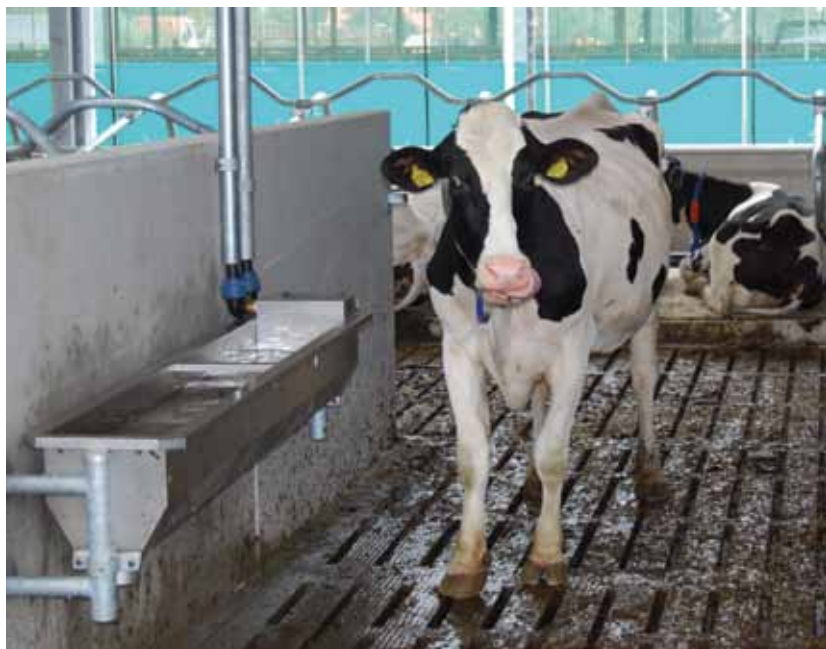
• Model 200, wall mounted