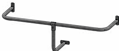
• Protection brace for model 150