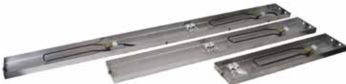
• Heating element for mounting below the drinking trough