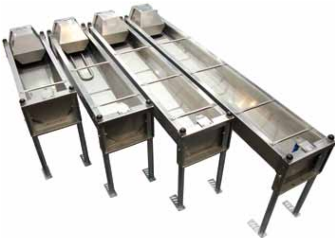
• Bulk drinking troughs model F